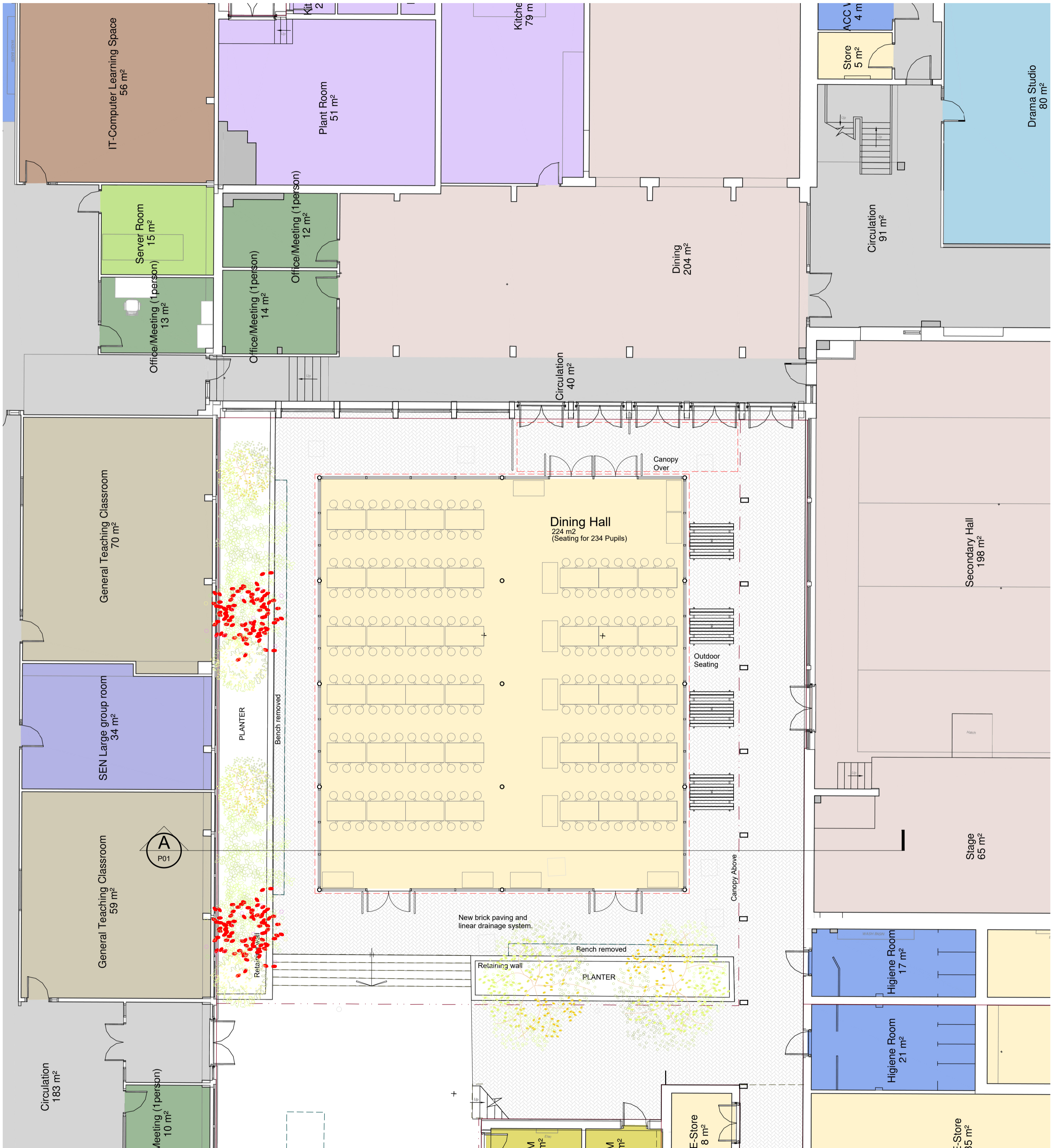
1 Proposed Floor Plan P01 Scale 1:100